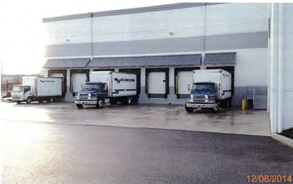
From north of building looking south at loading docks