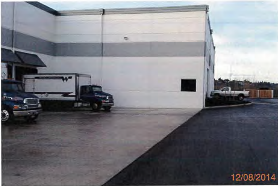
From northeast of building looking west at north face

If submitting more photographs than will fit on the preceding page, affix the additional photographs below. Identify all photographs with: date taken; "Front View" and "Rear View"; and, if required, "Right Side View" and "Left Side View." When applicable, photographs must show the foundation with representative examples of the flood openings or vents, as indicated in Section A8.