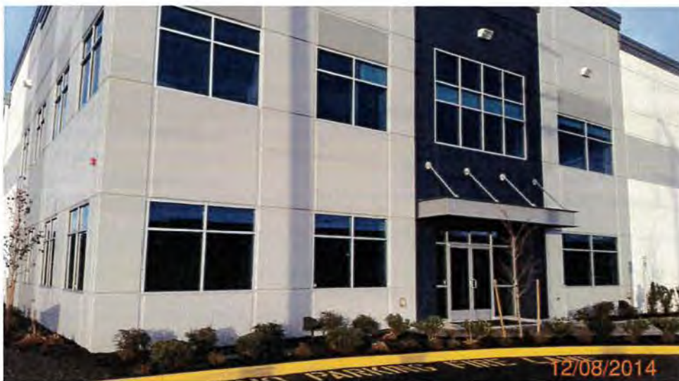
From southeast of building looking northwest at entrance

If using the Elevation Certificate to obtain NFIP flood insurance, affix at least 2 building photographs below according to the instructions for Item A6. Identify all photographs with date taken; "Front View" and "Rear View"; and, if required, "Right Side View" and "Left Side View." When applicable, photographs must show the foundation with representative examples of the flood openings or vents, as indicated in Section A8. If submitting more photographs than will fit on this page, use the Continuation Page.