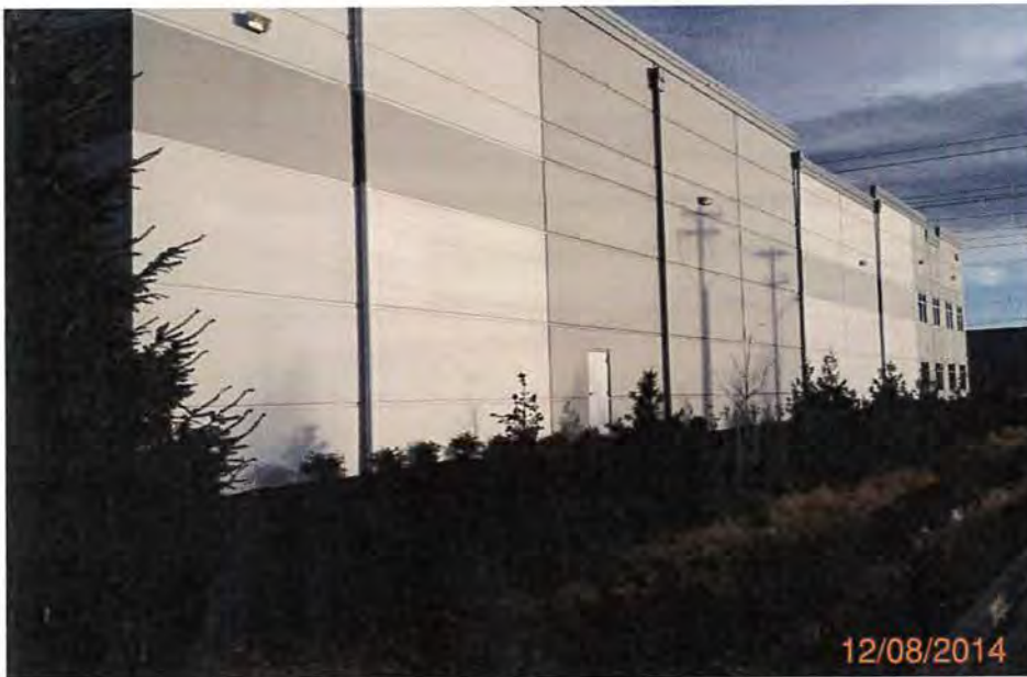
From southwest of building looking northeasterly at south face